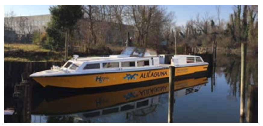
Fig.3 The HEPIC

high power, hydrogen could be used more for power supply of some auxiliary services rather than for propulsion. Therefore, hydrogen offers an interesting potential for passenger ferries operating on short distances (for example those for city use) generally having a limited power and autonomy request so that the space necessary for the storage of hydrogen on board would not be excessive, silence and the reduction of emissions are factors of great importance. Hydrogen-based technologies for maritime transport have big potentials in Italy, considering the number of ports and their volumes. Making industrial ports strategic hubs for hydrogen use for different types of activities would strongly