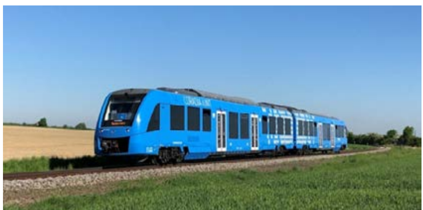
Fig.2 The "Coradia iLint" train

Hydrogen mobility is proving to be a valid alternative to Diesel fueled trains on non-electrified lines in Europe. Hydrogen trains are considered competitive for those railway sections not electrified, with low frequency of service and operating on long distances. These conditions are frequent in rail transport, making hydrogen rail mobility interesting from an economic point of view and an excellent opportunity to further decarbonise public transport. The fuel cell technology, unlike other "clean" technologies such as batteries, is able to offer high range in terms of mileage and high nominal driving power.