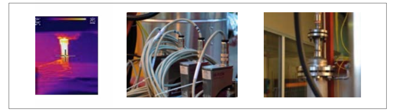
Fig.2 MENHIR plant details and thermal imaging camera during a test

cent solid oxide electrolyzers (SOEC). AELs use an alkaline solution (KOH or NaOH) at atmospheric or slightly higher pressure; PEMs polymeric membranes for protonic exchange; SOECs work at 700-800°C, their strength is reversibility, they can return power to the grid if necessary.