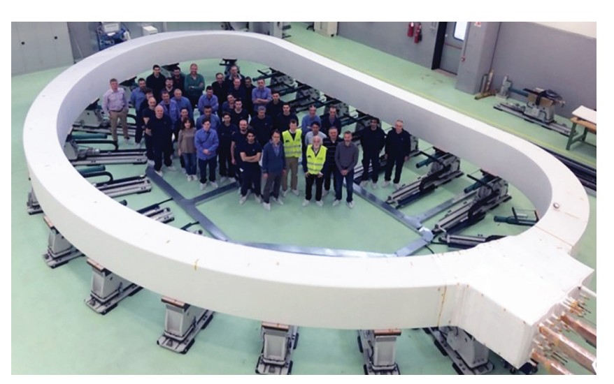
Fig. 4 The first-ever Winding Pack for the Toroidal Field coils

Whilst the ITER magnets will confine most of the hot plasma, some particles and radiation will inevitably escape from this magnetic 'cage'. To protect the Vacuum Vessel and