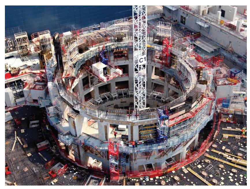
Fig. 3 Tokamak Building bio-shield under construction