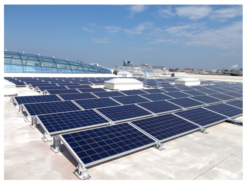
Photovoltaic system built by Conergy on the roof of the shopping center Romagna Valley Shopping in Savignano sul Rubicone

Under deep decarbonization, the scale of investment in low-carbon technologies will be orders of magnitude higher than current levels, creating major economic opportunities for forward-looking countries and businesses, provided there is sufficient certainty in climate policy. Policies may be required to aid firms and consumers with the higher upfront capital costs of lowcarbon technologies. This, however, is compensated by avoided expenditure on fossil fuels, as illustrated in the DDP analysis for the United States, in which the net cost of supplying and using energy for a deeply decarbonized scenario in 2050 rises by less than 1% over the period from 2014 to 2050.