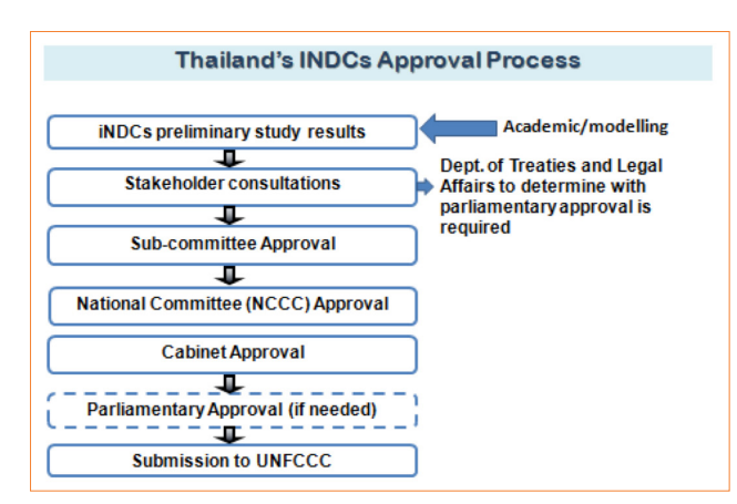
FIGURE 2 Thailand's INDC approval process

forestry, annual GHG reduction as well as cumulative emission reduction by 2030, avoiding double counting of actions. Figure 2 shows Thailand's INDC approval process.